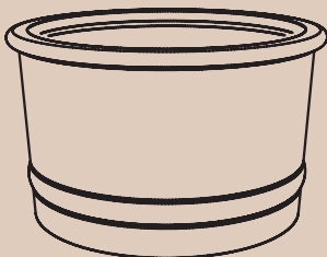
Florence Round FCS-4830

The Florence Collection includes a wide range of widths and heights, and is available in three configurations: round, square and rectangular. Widths vary from 24" to 60" in squares and rectangles, with heights 18" to 42". In the round configuration, heights vary from 18" to 36".