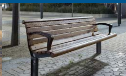
Sydney Collection featuring Boulevard wood

For more information about Boulevard Wood, visit http://tournesolsiteworks.com/boulevard.html .