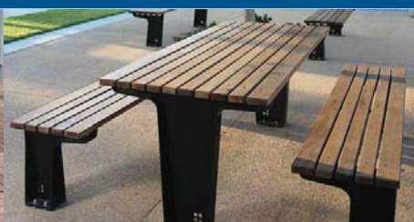
Northlakes Collection featuring Boulevard wood