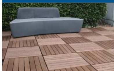
Boulevard Structural Wood Tiles